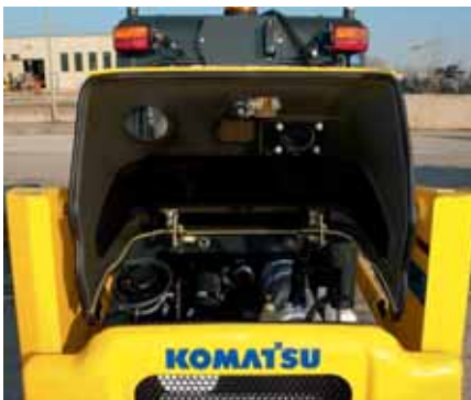
The bonnet: quick engine check