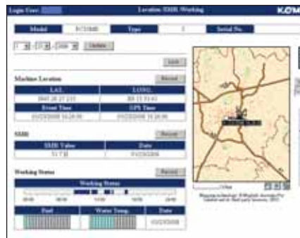
Machine working time - With the "daily working record" chart, get precise engine running time data: when your machine was started and when it was shut down, as well as total engine running time.

For further details on KOMTRAX™, please ask your Komatsu dealer for the latest KOMTRAX™ brochure.