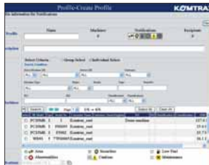
Alarm notifications - You can receive notification of alarms both via the KOMTRAX™ website and by e-mail.