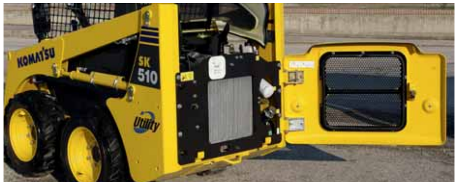
The hatchback: simple inspection and cleaning of the radiators