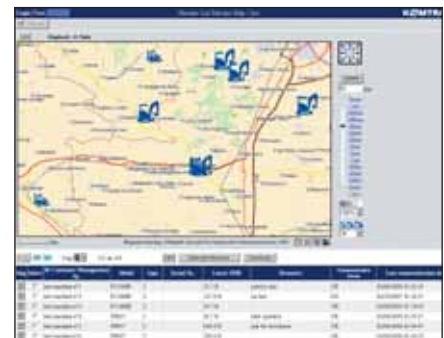
Fleet location - The machine list instantly locates all your machines, even those in other countries.