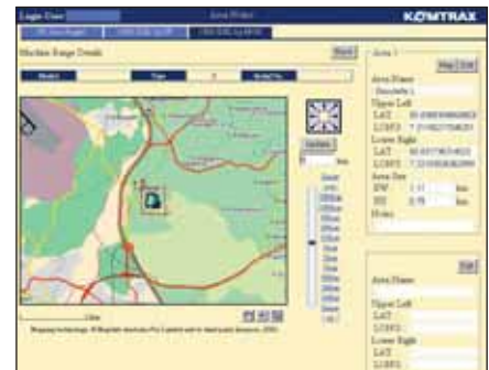
Added security - The "engine lock" feature allows to program when a machine's engine can be started. And with "geo-fence", KOMTRAX™ sends notification every time your machine moves in or out of a predetermined operating area.